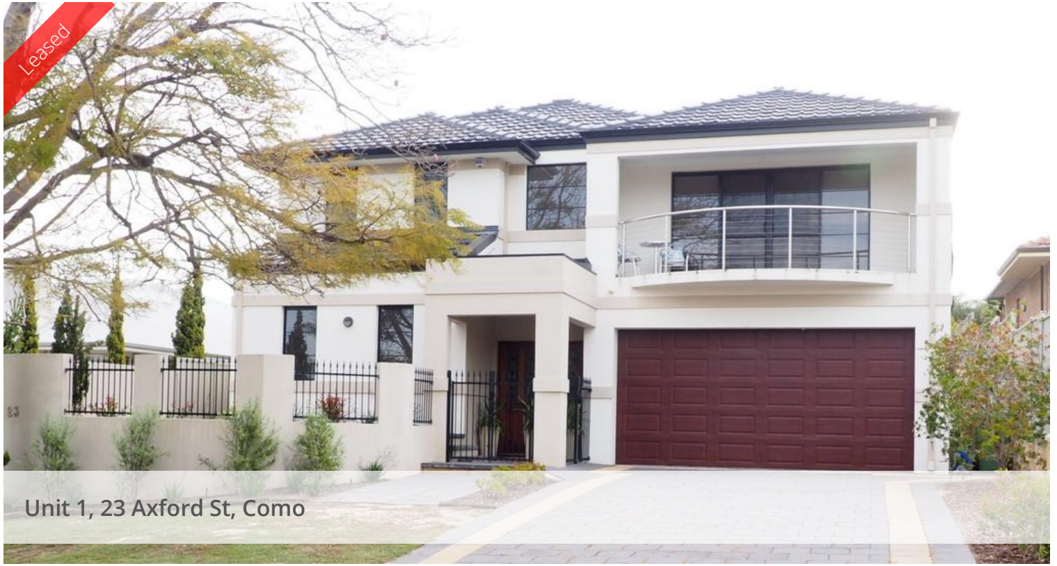
Unit 1, 23 Axford St, Como